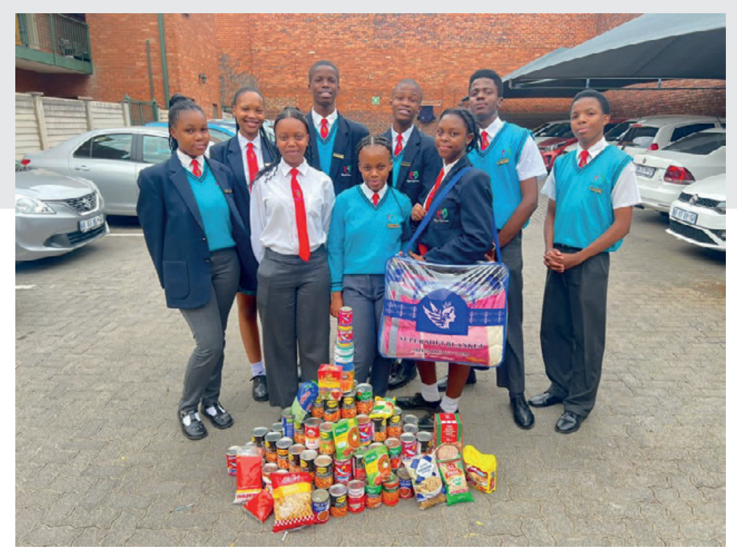
Outreach programme. Donations to Methodist Church of Southern Africa

We would like to thank your school for the generous donations of non-perishable food. As a church we support various organisations and feeding schemes through our members and minis-try groups. The food donated will be spread far and wide to care for those in need.