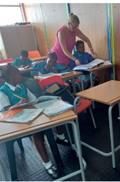
Services are available from 14h00 to 17h30